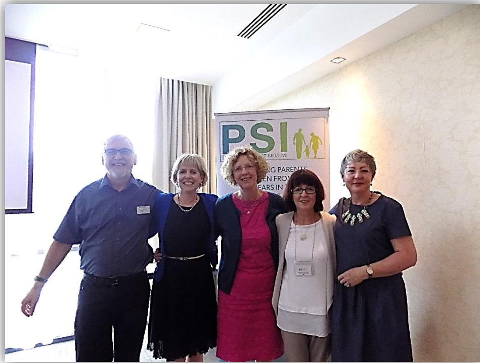
Katharine Howard Foundation Team at the PSI Networking Event, 31 May 2017.

The Foundation remains committed to this area of work and is even more aware of the importance of prevention and early intervention strategies and approaches in supporting parents with a focus on improving outcomes for children. The work of the Nurture Programme has also taken on board the learning from PSI.